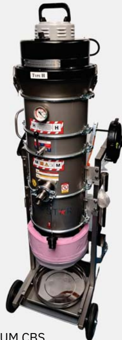
KEVA PREMIUM CBS

Filtration efficiency of greater than 99.995% at 0.3-0.6 microns