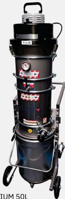
KEVA PREMIUM 50L